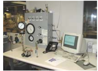
Gauge Calibration Stand