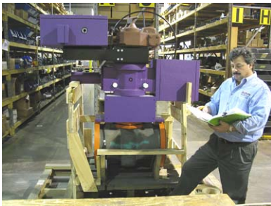
Automated 14" HF Plug Valve with Accessory Fireproofing