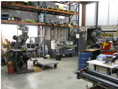
On-site Machine Shop