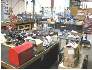
Valve Automation Assembly Area