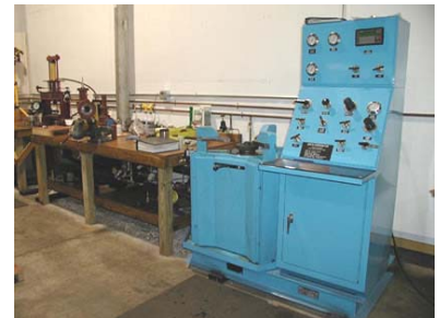
Pressure Relief Valve Test Stand