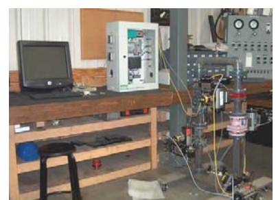
Valve Intelligence Center