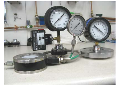
Gauge/Diaphragm Seal Assemblies