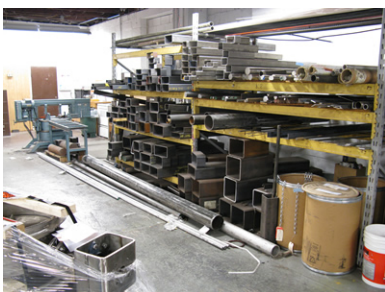
Tubular & Round Bar Steel for Manufacturing Mounting Hardware