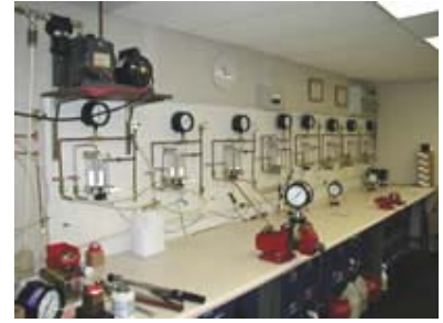
Diaphragm Seal/Isolator Filling Stations