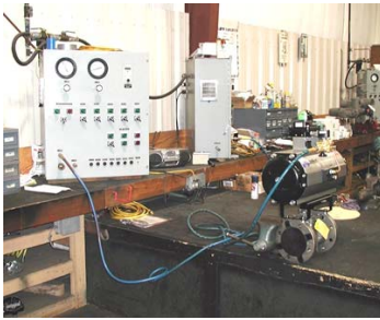
Valve Assembly Under Test